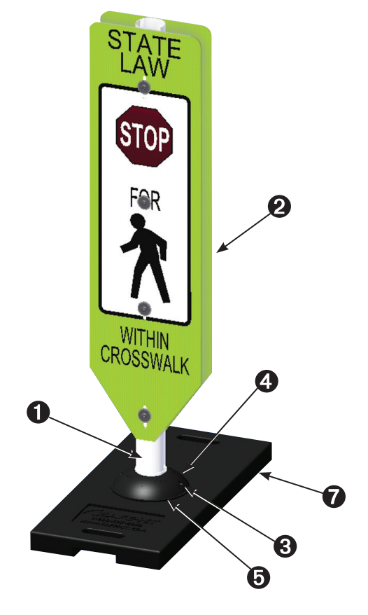
PEDESTRIAN CROSSING ASSEMBLY